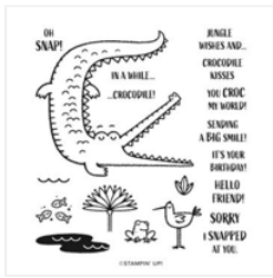
Oh Snap Photopolymer Stamp Set - 154486

Angie Juda http://orderwithangie.com helpdesk@chicnscratch.com ChicnScratch.com