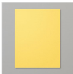
Daffodil Delight 8-1/2" X 11" Cardstock - 119683