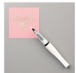
Wink Of Stella Clear Glitter Brush - 141897