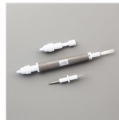
Take Your Pick - 144107