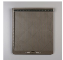
Simply Scored Scoring Tool - 122334