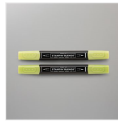
Granny Apple Green Stampin' Blends Combo Pack - 154885