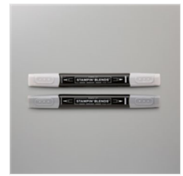
Smoky Slate Stampin' Blends Combo Pack - 154904