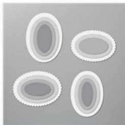
Layering Ovals Dies - 151771