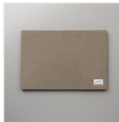
Stampin' Pierce Mat - 126199