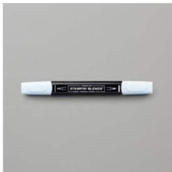
Seaside Spray Light Stampin' Blends Marker