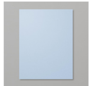
Seaside Spray 8-1/2 X 11 Cardstock