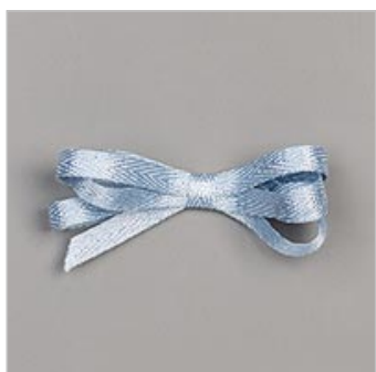
Seaside Spray 1/4" (6.4 Mm) Metallic Ribbon