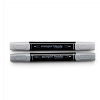
Smoky Slate Stampin' Blends Markers Combo Pack