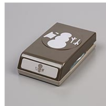
Snowman Builder Punch