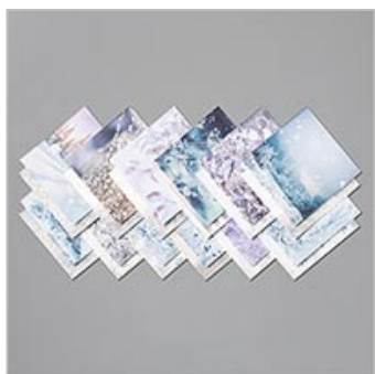
Feels Like Frost Specialty 6" X 6" (15.2 X 15.2 Cm) Designer Series Paper