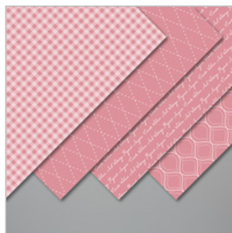
2019–2021 In Color 6" X 6" (15.2 X 15.2 Cm) Designer Series Paper