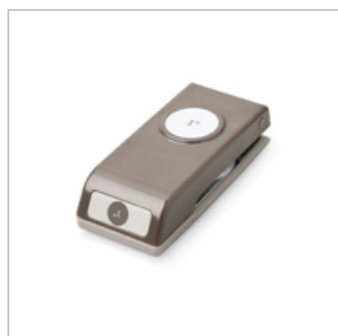
1" (2.5 Cm) Circle Punch