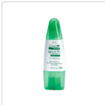
Multipurpose Liquid Glue