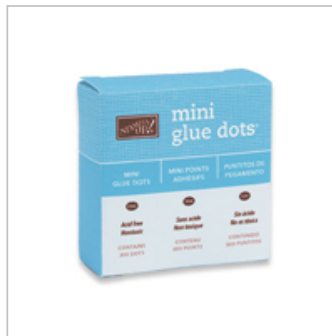
Mini Glue Dots