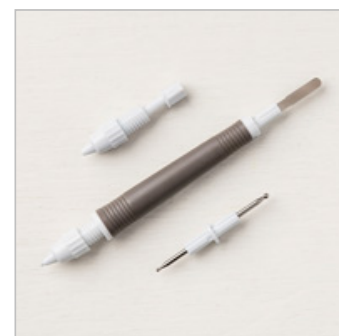
Take Your Pick