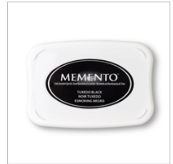
Tuxedo Black Memento Ink Pad