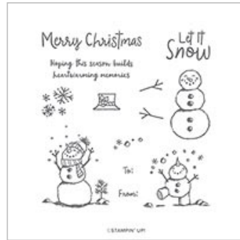
Snowman Season Photopolymer Stamp Set (En)