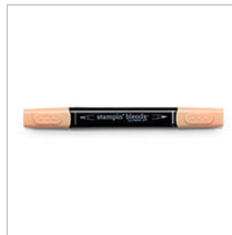
Pumpkin Pie Light Stampin' Blends Marker