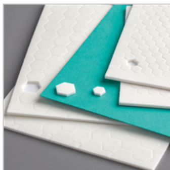
Mini Stampin' Dimensionals