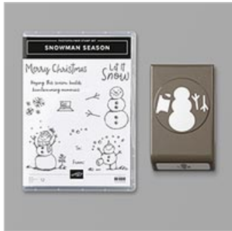
Snowman Season Bundle (En)