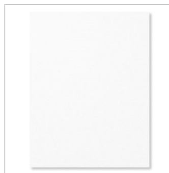
Whisper White 8-1/2" X 11" Cardstock