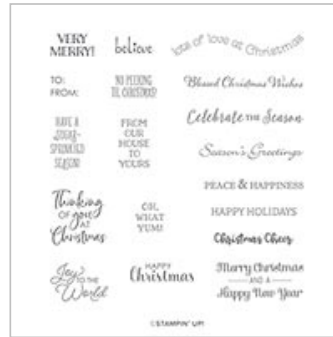
Itty Bitty Christmas Cling Stamp Set (En)