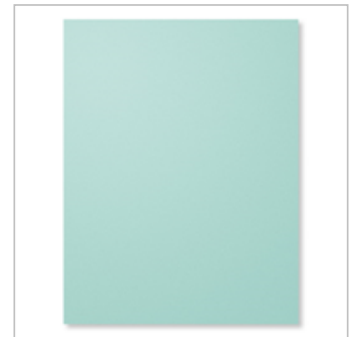
Pool Party 8-1/2" X 11" Cardstock