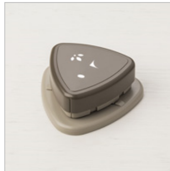
Detailed Trio Punch