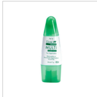
Multipurpose Liquid Glue 110755