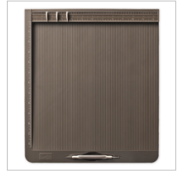
Simply Scored 122334