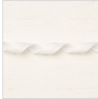
Whisper White 5/8" (1.6 Cm) Flax Ribbon