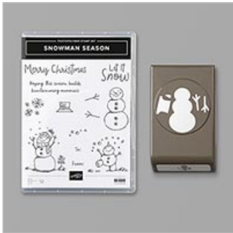
Snowman Season Bundle (En)