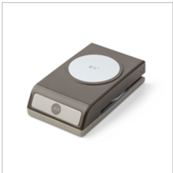
2-1/4" (5.7 Cm) Circle