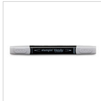
Smoky Slate Light Stampin' Blends Marker