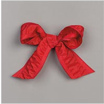
Real Red 1" (2.5 Cm) Ruched Ribbon