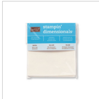
Stampin' Dimensionals 104430