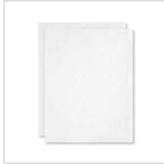
Vellum 8-1/2" X 11"