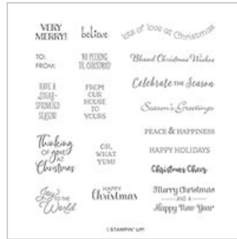
Itty Bitty Christmas Cling Stamp Set (En)