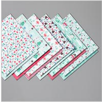
Let It Snow Specialty