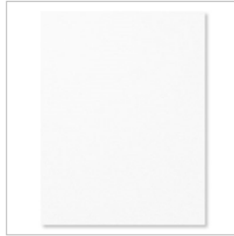
Whisper White 8-1/2"