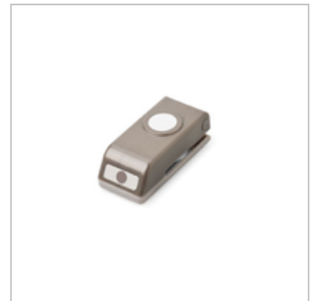
1/2" (1.3 Cm) Circle