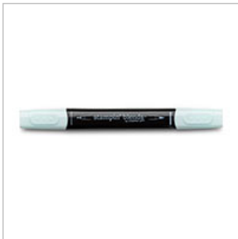
Pool Party Light Stampin' Blends Marker