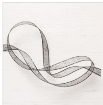
Black 5/8" (1.6 Cm) Glittered Organdy Ribbon