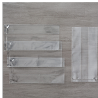
3" X 6" (7.6 X 15.2 Cm) Gusseted Cellophane Bags