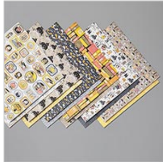
Monster Bash Designer Series