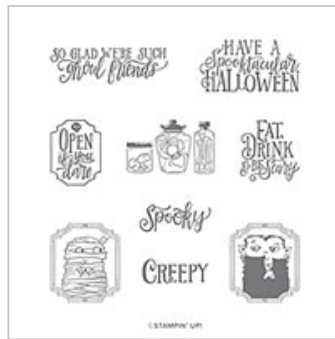
Spooktacular Bash Cling Stamp Set