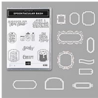
Spooktacular Bash Bundle

Remove Shaded, Score on Dotted Lines, Cut on Solid Lines Cardstock: 8-1/2 x 5 (or 5-1/2 for a larger box).