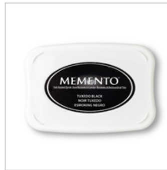
Tuxedo Black Memento Ink Pad