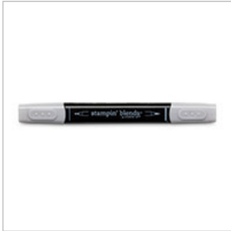
Smoky Slate Light Stampin' Blends