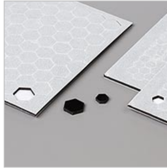
Black Stampin' Dimensionals Combo Pack