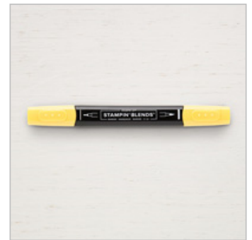
Mango Melody Light Stampin' Blends