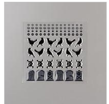
Monster Bash Enamel Shapes