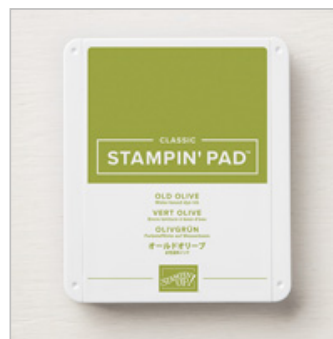
Old Olive Classic Stampin' Pad