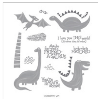
Dino Days Photopolymer Stamp Set