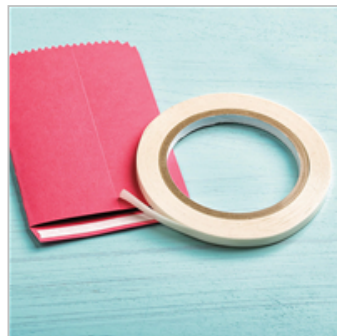
Tear & Tape Adhesive