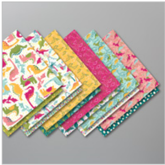
Dinoroar Designer Series Paper