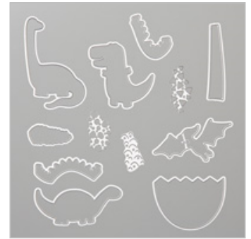
Dino Dies 149636