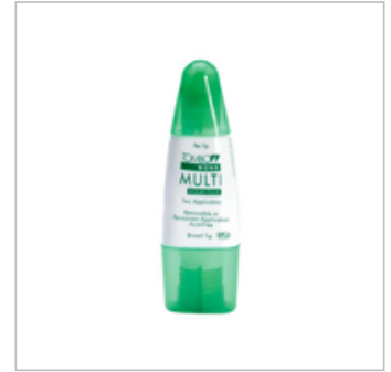
Multipurpose Liquid Glue