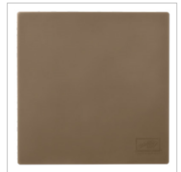
Silicone Craft Sheet