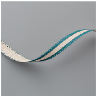
Pretty Peacock 1/2" (1.3 Cm) Scalloped Linen Ribbon