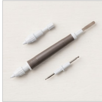
Take Your Pick