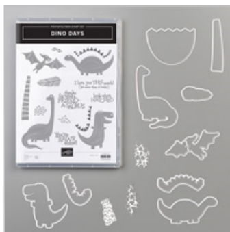
Dino Days Bundle