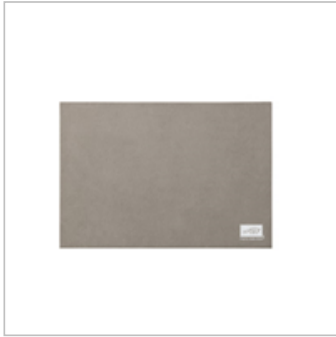
Stampin' Pierce Mat

Angie Juda http://orderwithangie.com angie@chicnscratch.com ChicnScratch.com