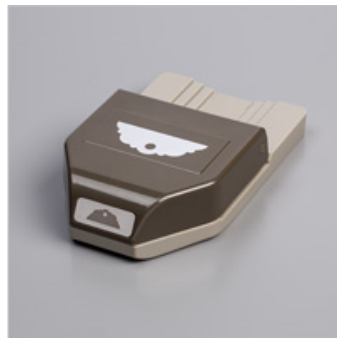
Delightful Tag Topper Punch