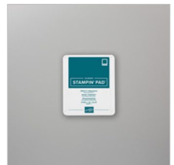
Pretty Peacock Classic Stampin' Pad