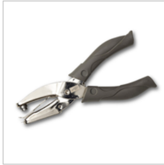
1/8" (3.2 Mm) Circle Punch