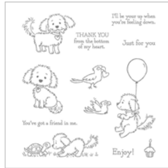
Bella & Friends Wood-Mount Stamp Set