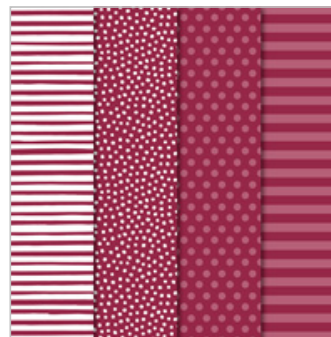
Neutrals 6" X 6" (15.2 X 15.2 Cm) Designer Series Paper