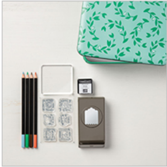
Cute Crew Punch Box