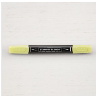
Light Granny Apple Green Stampin' Blends Marker