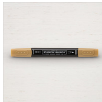
Light Soft Suede Stampin' Blends Marker